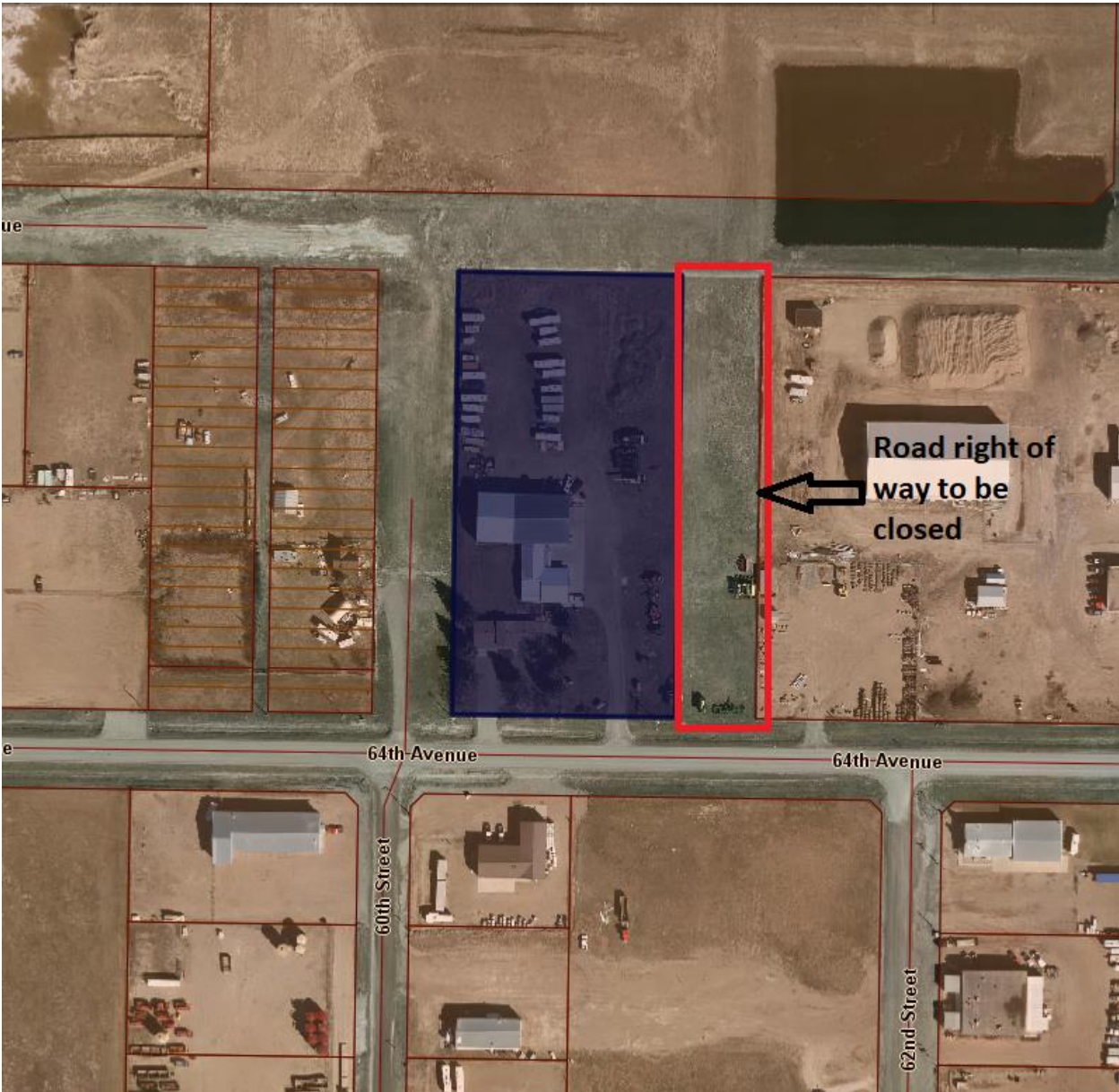
Road right of way adjacent to 6009 64 Ave, Taber.