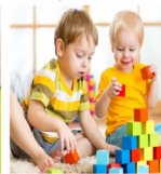
Language & Communication