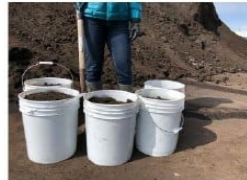
Five 20 litre (five gallon) buckets filled with compost (approximate size 12" x 15")

You can take up to 100 litres of compost per vehicle, per day (no mechanical equipment allowed for loading). NO TRAILERS OR COMMERCIAL VEHICLES