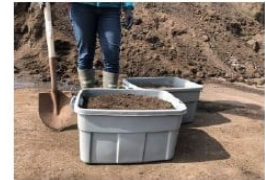
Two 50 litre plastic tubs filled with compost (approximate size is 24" x 16" x 12")